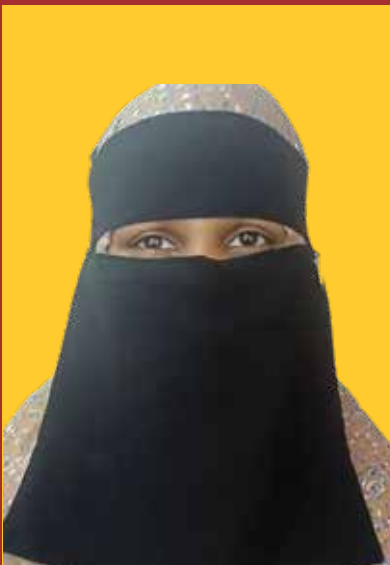
Cause ID - 24709 Bangalore, Karnataka

Alhamdulillah, with the generous support of IndiaZakat donors, ₹62,000 has been raised to support her education and reduce the financial burden on her family. This support is helping her continue her studies and move closer to achieving her dreams.