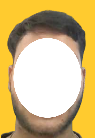
Cause ID - 24603 Lucknow, Uttar Pradesh

Over the past five years, IndiaZakat has created a significant impact. In April 2026 alone, 1,157 causes were supported by 246 donors.